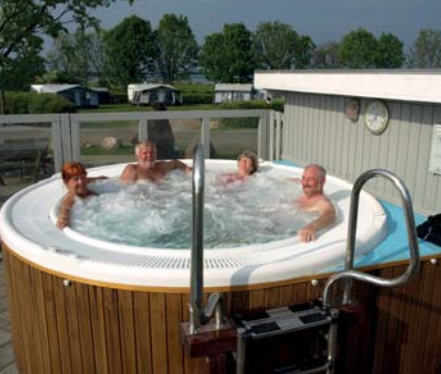
Foaming water at the Wellness Center