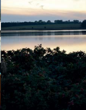
...and the quiet water of the Fjord