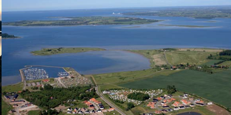
Holbæk Fjord with the gateway in the foreground