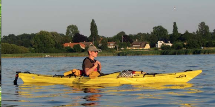
Kayaker in Holbæk Fjord