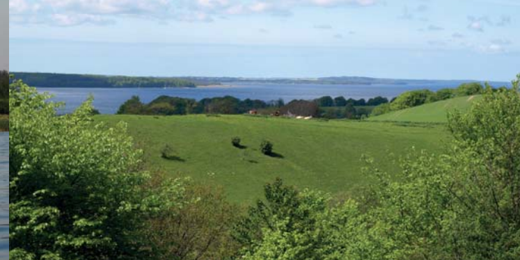
View over Holbæk Fjord