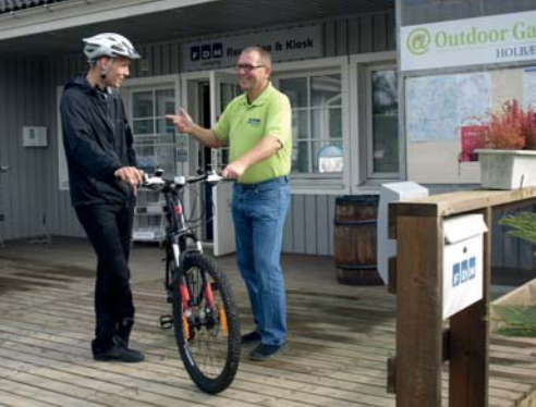
Outdoor Gateway Holbæk Fjord