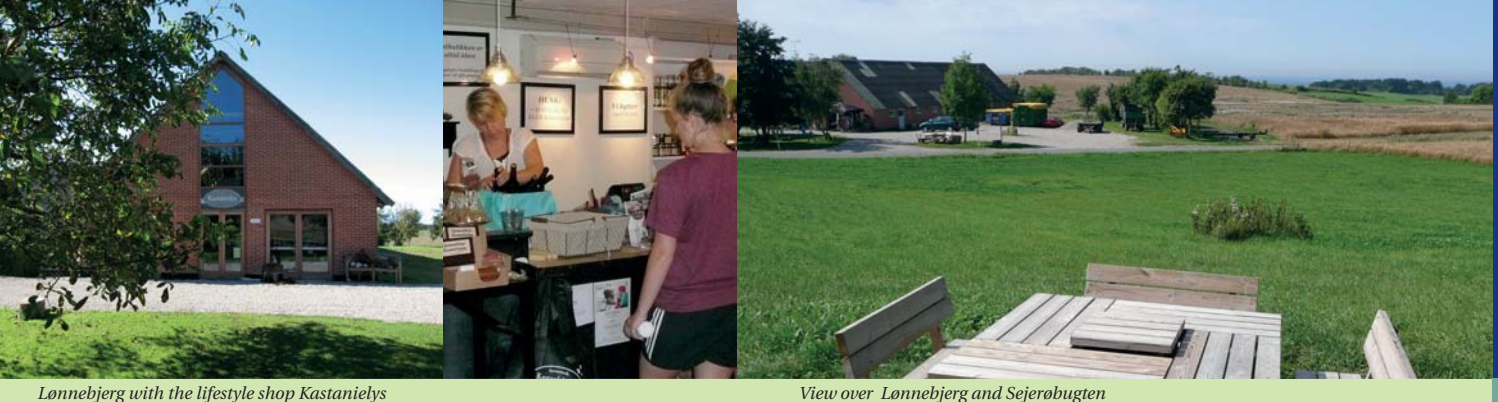
Lønnebjerg with the lifestyle shop Kastanielys