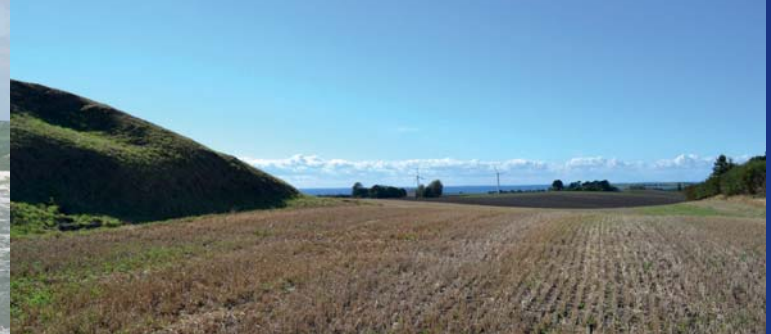
View from Urhøj to Bjerge Strand