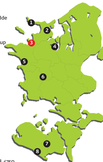
Layout: BJ Lideklame.