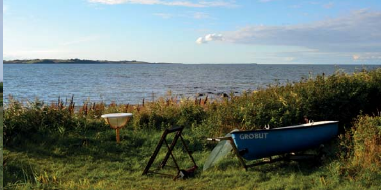
View over Sejerøbugten