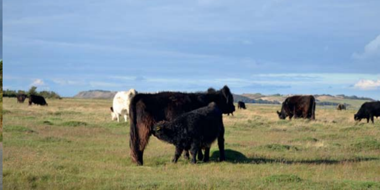
Nature management on Vesterlyng