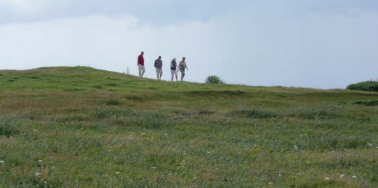
Dunes on Vesterlyng