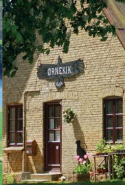
The farm shop