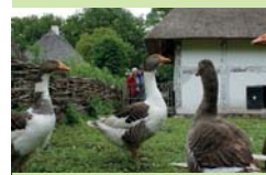
Maribo Open Air Museum