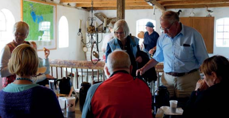
Disseminating room with café atmosphere