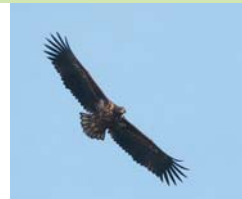
Eagle over the Maribo Lakes

For a trip all around Røgbølle Sø, take the Hejrede Sø-Høvænge Skov route, which connects Maribo Lakes Nature Park by small country roads to Paradisruten .