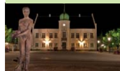
Maribo Square by night