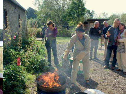
Harvest festival at Hejrede Friluftsgård