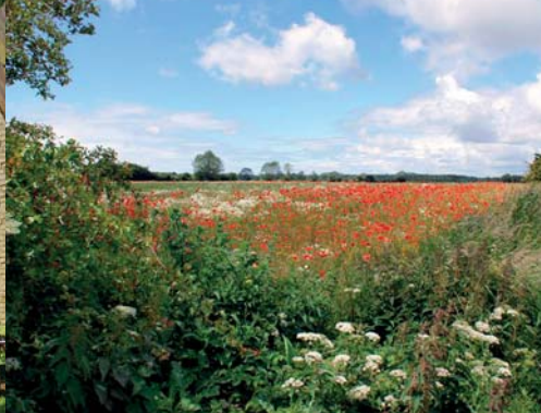
Flower meadow at Hejrede Friluftsgård