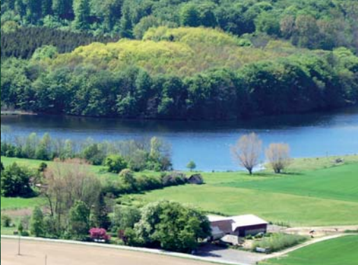
Outdoor Gateway Hejrede Friluftsgård