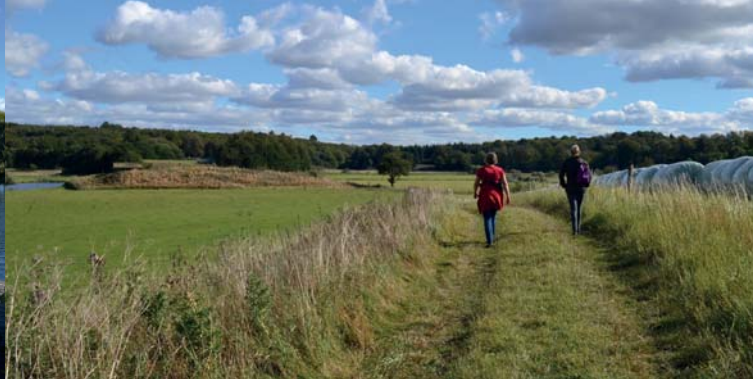
Tamose Bog Area