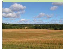
View from Bjergstien