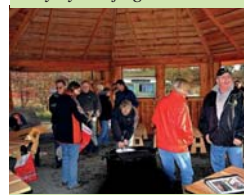
Shelter with campfire