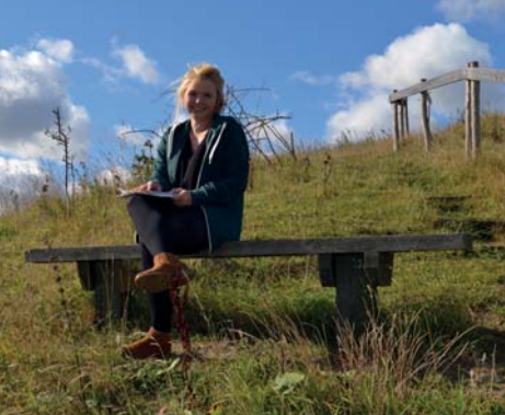
Resting on Bjerget