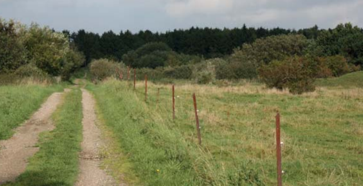
Road down to the Outdoor Gateway