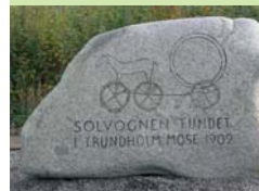
Mark of the Sunwagon find