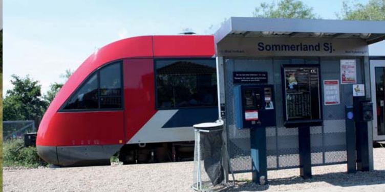
Sommerland has its own train stop