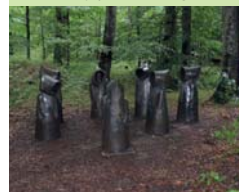
Forest Folk in Ulkerup Skov