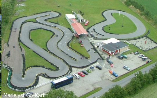
Marielyst Go Kart